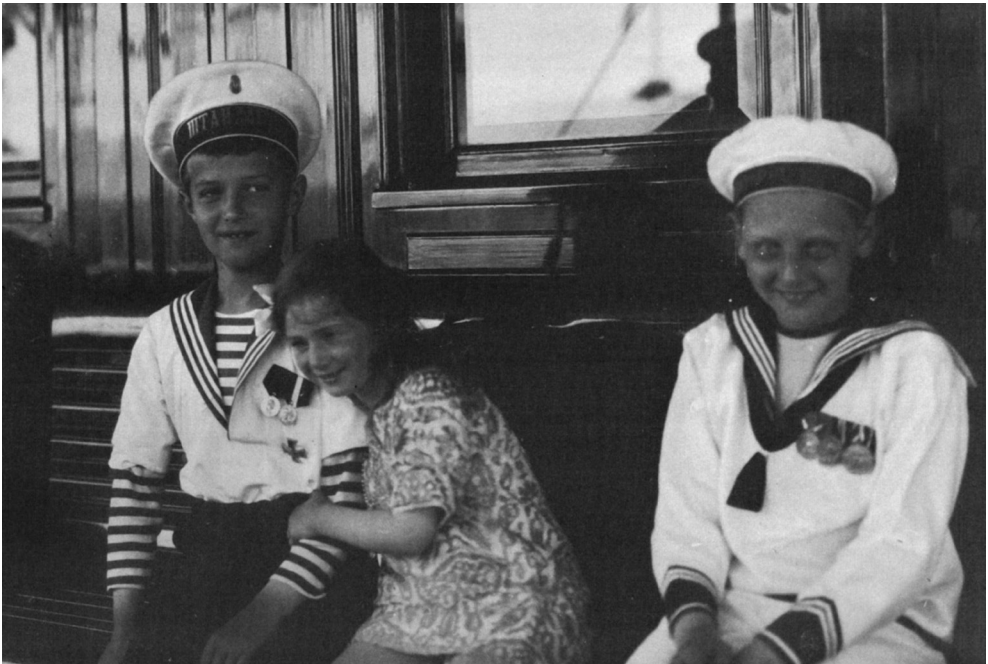
Tsarevitch ALEXEI NIKOLAEVICH (left), Princess ILEANA (middle), Prince NICHOLAS (right) during playtime onboard the Standard imperial yacht, 1 June 1914. The photo was taken on the occasion of the visit of Tsar NICHOLAS II to Constanța harbour. It is impressive that the two nephews of King CAROL I—ILEANA and NICHOLAS—removed the state of apathy from the suffering Tsarevitch ALEXEI. This success of the two Romanian princes elated Tsarina ALEXANDRA, too. She was happy that her son, ALEXEI, intimately called BABY, was playing and was happy.

The tsar proved to be extremely benevolent. He also accepted on the guest list the name of Constantin Stere, who was the rector of the University of Iași, an imperial subject in his youth at one point exiled to Siberia. The tsar also accepted to receive a delegation of the Russians who, although had not been deprived of citizenship, were not allowed to enter the Tsarist Empire. On his ship, the tsar had long discussions with Prime Minister Ion I. C. Brătianu and with the Foreign Affairs Minister Emanoil Porumbaru. The Russian monarch declared to the Romanian politicians that should a military action lead to an invasion of Serbia, he would not remain indifferent. 8 The issues at stake were pan-Slavism and the defense of Slavic peoples. King Carol I adopted a wait-and-see position. As soon as he got off the boat, Brătianu ran to the telegraph station in town and telegraphed notes to Berlin and Vienna about the discussions that he