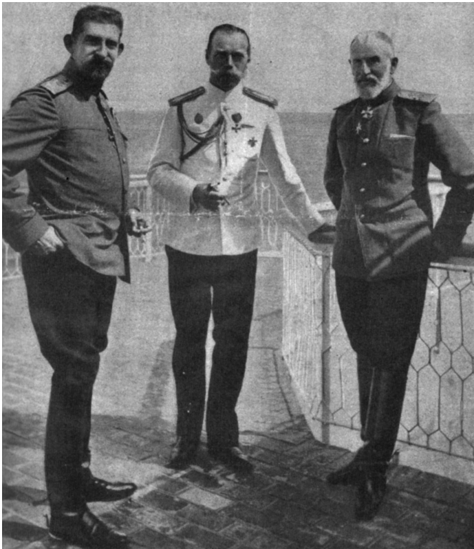
Prince FERDINAND, Tsar NICHOLAS II and King CAROL I, on the seashore, on 1 June 1914, during the visit of the Russian monarch to Constanța harbour.

At that time, at the beginning of World War I, a popular joke in Bucharest dealt with Romania's neutrality. It said that P. P. Carp asserted that the time had come for Romania to enter the war. Nicolae Filipescu, an Entente supporter and a Francophile, said that the time had not yet come for us to join the fight alongside the Entente. In conclusion, Mr. Brătianu believed that it was best... not to look at the time.