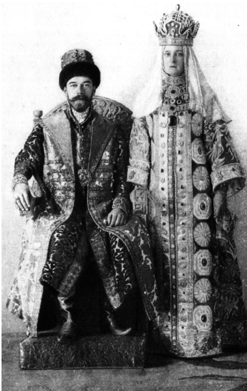
Tsar NICHOLAS II and his wife, Tsarina ALEXANDRA, wearing traditional Russian costume.

First of all, the marriage between the Grand Duchess Olga and Prince Carol was postponed sine die. The main reason for this cancellation were the hesitations of Princess Mary of