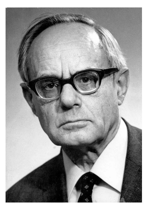
Karl Rahner (1904–1984)

not been fully settled until the present, although ecumenical solutions are currently being sought."<sup>11</sup> If the Eastern Churches do not remove the Filioque addition as heretical, neither should the Roman Catholic Church ask them to insert Filioque in their Confessions of faith.<sup>12</sup>