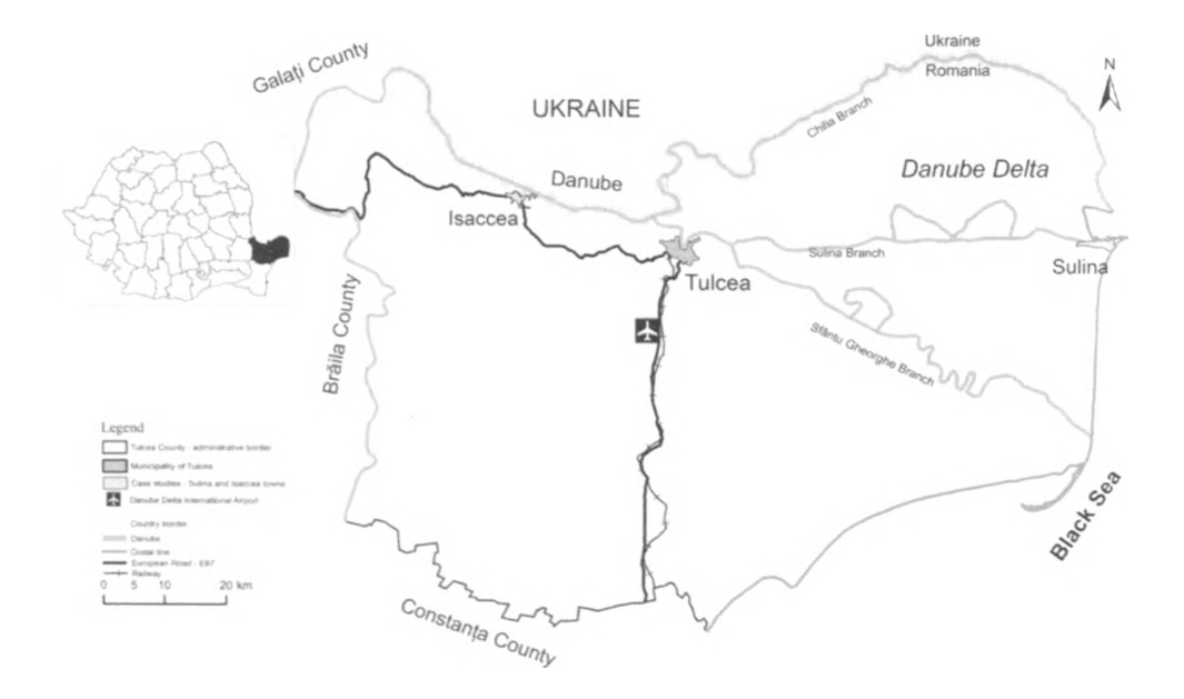
FIGURE 1. Territorial context within Tulcea County

The study area includes two small towns in southeastern Romania, in Tulcea County, Sulina and Isaccea (figure 1). Although less important in terms of population, due to economic functions held in certain historical periods these towns exercised their role as a local polarizing center for the surrounding rural area. The political changes that occurred in the late '80s, as in the case of many small towns of Romania (Filimon et al. 2011; Petrea et al. 2013), led to their decay, manifested as a loss of economic function and thus as social and physical degradation, the small towns facing complex challenges at the moment.