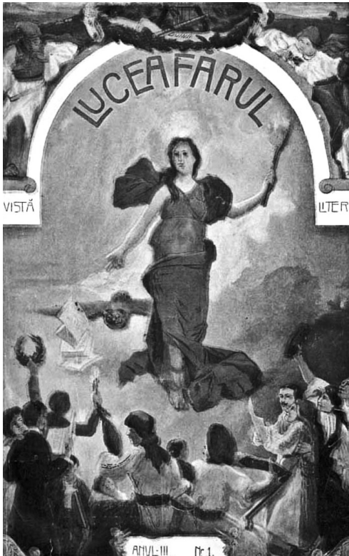
Cover of Luceafărul magazine, no. 1 of 1904, suggestively illustrating “The Resurrection” of the Romanian nation

After he took over the magazine from Aurel P. Bănuț, he relocated the editorial offices to his house, being assisted in the editorial work by Octavian Goga. Together they faced the difficulties caused by the lack of money needed for the publication of the magazine (Tăslăuanu 1939, 14). Starting with 1