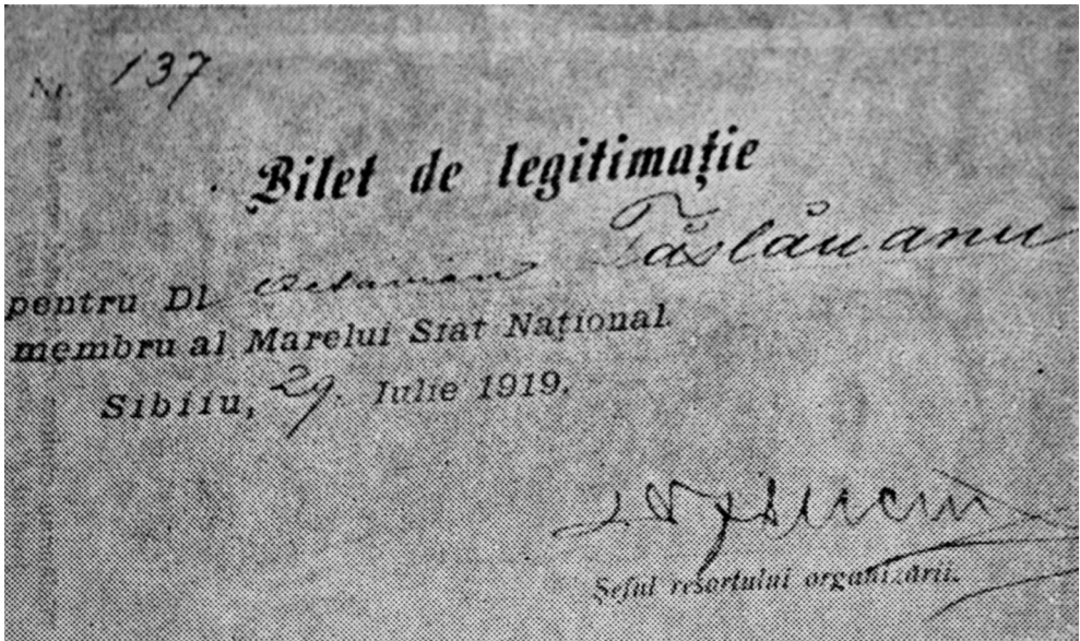
The card of OCTAVIAN C. TĂSLĂUANU, member of the Great Romanian National Assembly

minister of commerce and industry, from 13 March to 16 November 1920 and minister of public works, from 16 November to 1 January 1921, in Alexandru Averescu's government; in 1926 he became senator of Mureș (Buta and Onofreiu 2016, 94). In his short ministerial period he proved to be extremely active, initiating a series of laws and reforms meant to reorganize the national economy.