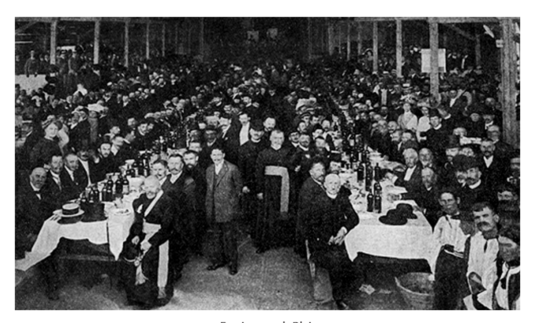
Festive meal, Blaj.

In 1904 there was another significant jubilee in Blaj, the see of the Romanian Greek Catholic Church: the archdiocesan schools were celebrating 150 years since their establishment. The festivities were promoted as a duty for the Romanian Greek Catholics, especially since the Hungarian Parliament was debating a new Law of public education that had profound implications for the education in the Romanian language. The periodical Univea endorsed the celebration of