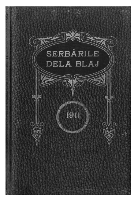
Serbările de la Blaj 1911: O pagină din istoria noastră culturală (Blaj, 1911).