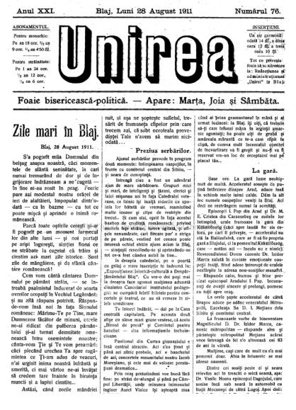
Unirea 21, 76 (1911).

Metropolitan Bishop Victor Mihályi intended to revive the past glory of the archbishops of Blaj, from a time when the joint efforts with the Orthodox Church were common sense, and both hierarchs of the Romanian denominations in Transylvania co-signed documents of importance for the future of the Romanian people. Prior to the Revolution of 1848, the ecclesiastical elite had lead the Romanian national movement. Therefore, those days were considered the glory days for the church; afterwards, the lay elite assumed the leadership and representation of the nation.<sup>54</sup>