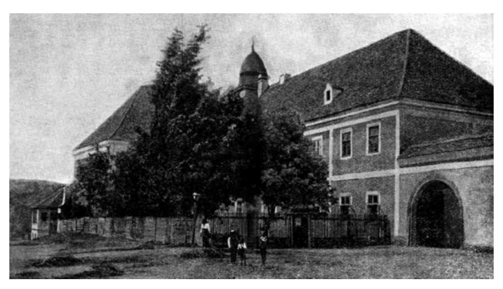
The old metropolitan residence of Blaj.

By definition, the jubilee is a special anniversary of a specific moment in the life or activity of a person, as well as a representative episode in the history of a group or a community, usually offering the group the chance of rejoicing in celebration. The festivities are public rituals orchestrated to reunite and entertain the community, mostly with the intent of honoring a moment, an event or a