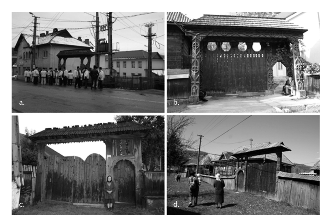
Fig. 2. The social role of the wooden gate as artwork. a. New gate in front of a cultural establishment and school in Bârsana (2010); b. Sunday meeting and socialization place; c. Waiting for the family; d. Old village streetfront, today a secondary transportation option used by tourists (see the grass on the road) Rona de Jos (2007).

from among the local stakeholders or with the mayor. Therefore, displaying it in certain positions enhances the access of the viewer, reflects the relationship of the artist with the beneficiary and with the public, being conversely a discourse about social status, economic or another kind of power. Articulating these, the art in the public realm refers to the forum where artists with divergent views on traditional gates meet.