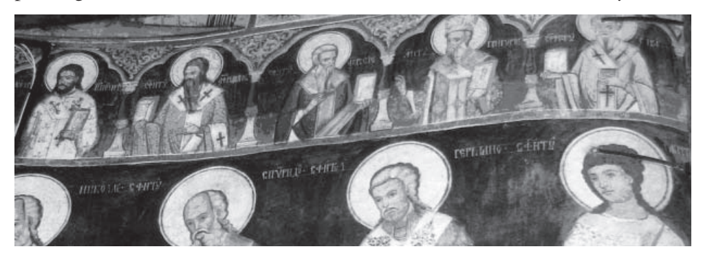
Fig. 5. St. Patriarchs, St. Nicholas church, Fărăgaş, altar (painters Preda and Teodosie)

The identification of Andrei the painter from Săraca with Andrei, the painter from Hurezi shows, however, a number of inconsistencies. The first is related to the Greek origin of the painter Andrei from Hurezi, which is quite clearly revealed in the inscriptions from the churches he painted, but which disappears completely at Săraca. There is also the argument of the paintings' style: the paintings at Săraca are more modest than the mural assemblies made by Andrei