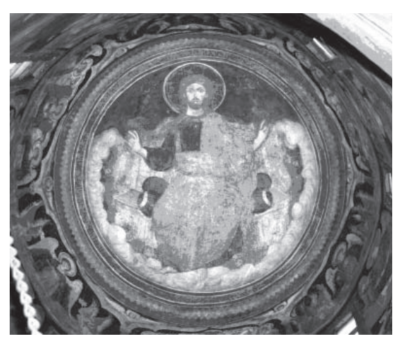
Fig. 4. Christ on throne, Sărăcineşti, the nave dome (painters Preda and Teodosie)

churches in Sărata, 1806, Colun, 1811, Arpaşu de Sus, 1815, Voevodenii Mici, 1820).<sup>21</sup>