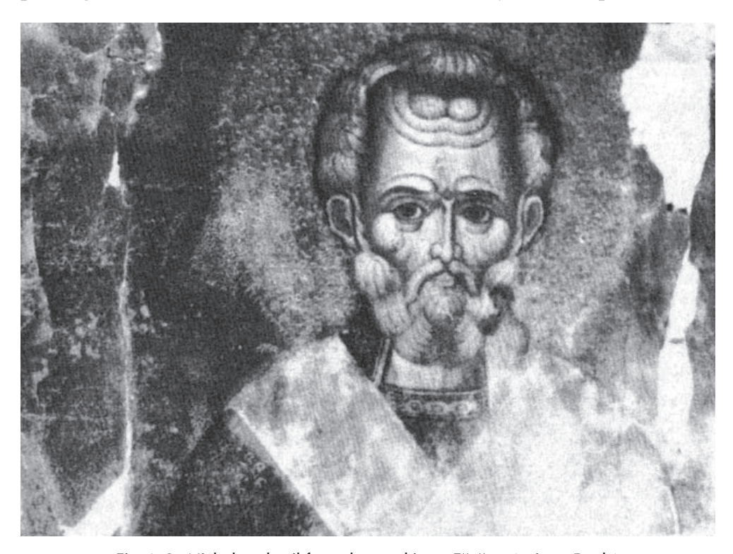
Fig. 1. St. Nicholas, detail from the royal icon, Făgăraş (painter Preda)

The mentioned icons of Făgăraş are the only paintings from Constantin Brâncoveanu's time preserved in Transylvania. The other Transylvanian works attributed to the elite Brâncoveanu painters are actually ulterior, and were conceived in a significantly changed cultural and doctrinal context, following the union with Rome of part of the Romanian Church in Transylvania, and the disappearance, with the creation of the Greek-Catholic bishopric, of the Orthodox Metropolitan see of Alba Iulia. The activity of the elite painters from Hurezi, relatively well documented for the times of Brâncoveanu, becomes more difficult to follow after the disappearance of the Wallachian princely orders in Oltenia during the Austrian administration (1716–1739). However, the active presence of younger painters from the Hurezi group is often attested in this period, the orders coming from the clergy of the bishopric of Râmnic, as with the mural paintings in Sărăcineşti (1717–1718, commissioned by the Bishop Damaschin