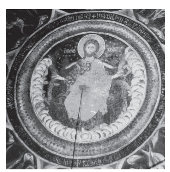
Fig. 3. Christ on throne, Făgăraş, the nave dome (painters Preda and Teodosie)

It is not known if Teodosie was a direct disciple of Iosif (the inscription on the