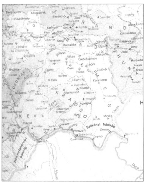
FIGURE 1: Counties in the Danube-Tisa-Mureş Region in the late 15th century

Immediately after Csanád's victory over Ajtony, a bishopric was organized around Marosvár (or Csanádvár, as it was named from this time on), whose borders coincided