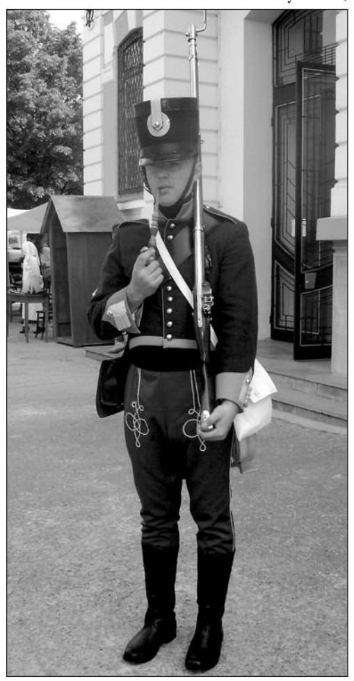
Photo 2 summer and fir tree needles in winter, indicating that the soldier was on cam-

The reconstruction of the Romanian guard of the Austrian Border unit was finally completed with the addition of a military rifle from the 19th century. At the Celebrations of the Bucharest Military Museum in 2010, a 19th century